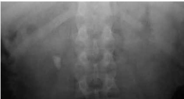
Figure 1. X-ray KUB before Lithotripsy

Our patient did not have any serious complications such as perirenal hematoma or urosepsis. Most case of Steinstrasse were treated with analgesics, antibiotics and antispasmodics and extra water consumption with favorable outcome but a few cases required ureteroscopic removal of stone (URSL) and double J stent placement. Minor post procedural complication noticed in majority of the cases was haematuria which was insignificant and rarely lasted for more than 24 hours. Other minor complications observed were skin bruise, nausea and colicky pain, very similar to other studies.