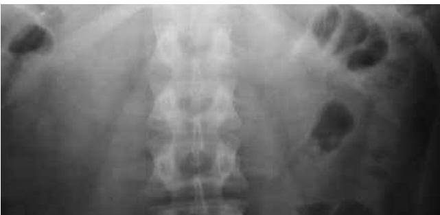
Figure 1. X-ray KUB after Lithotripsy