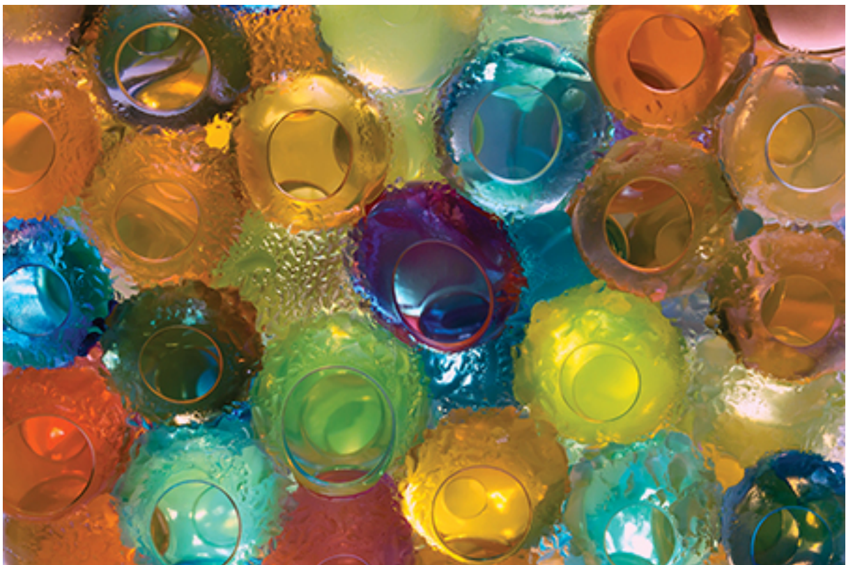
Figure 3. Water-absorbing gel beads look like candy so children may be tempted to swallow them. 18